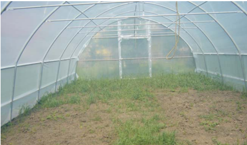
One of the donated greenhouses within the project

On the basis of the presented data we monitor the growth in the beneficiary's income, if we consider that in _ 2011 we had 53 beneficiaries, whereas in 2012 we have 114 beneficiaries that are economically strong.