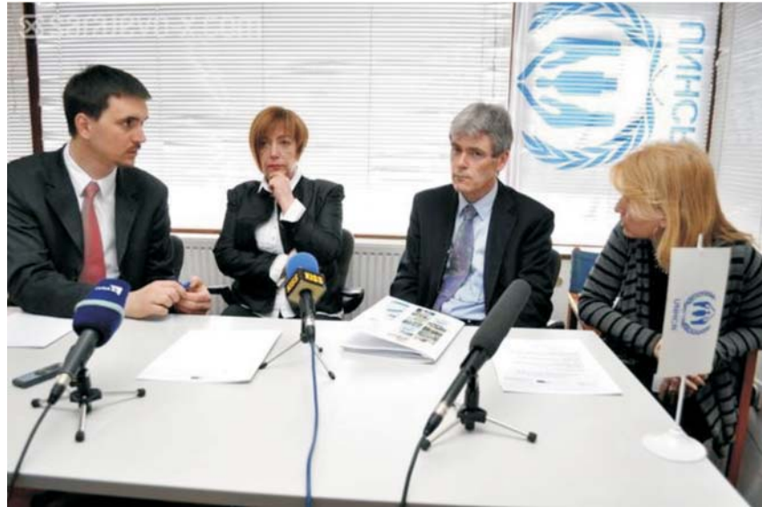
Press conference on the occasion of the opening of the Centre for Women