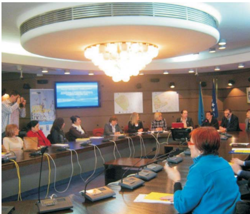
Official presentation of the results of the Analysis to the City Administration

Raised awareness of the population of the municipality and beyond (City of Sarajevo), opportunities and ways of converting the municipality of Novi Grad into a safe community.