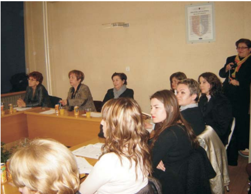
The participants of the Round Table within the Project. Topic: A multidisciplinary approach to people with experience of domestic violence and perpetrators of violence

Effective assistance and protection for persons exposed to domestic violence through the establishment of institutional treatment of perpetrators of violence.