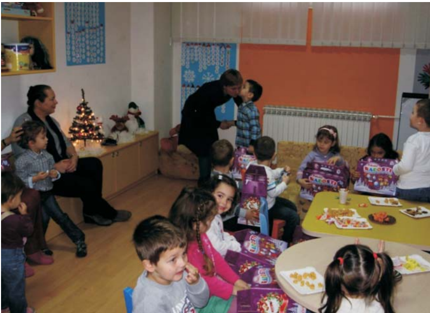
Distribution of packets for New Year

The total number of beneficiaries for the period April – December 2012 was 264 (Cycle VI was attended by 124 users, Cycle VII was attended by 140 users).