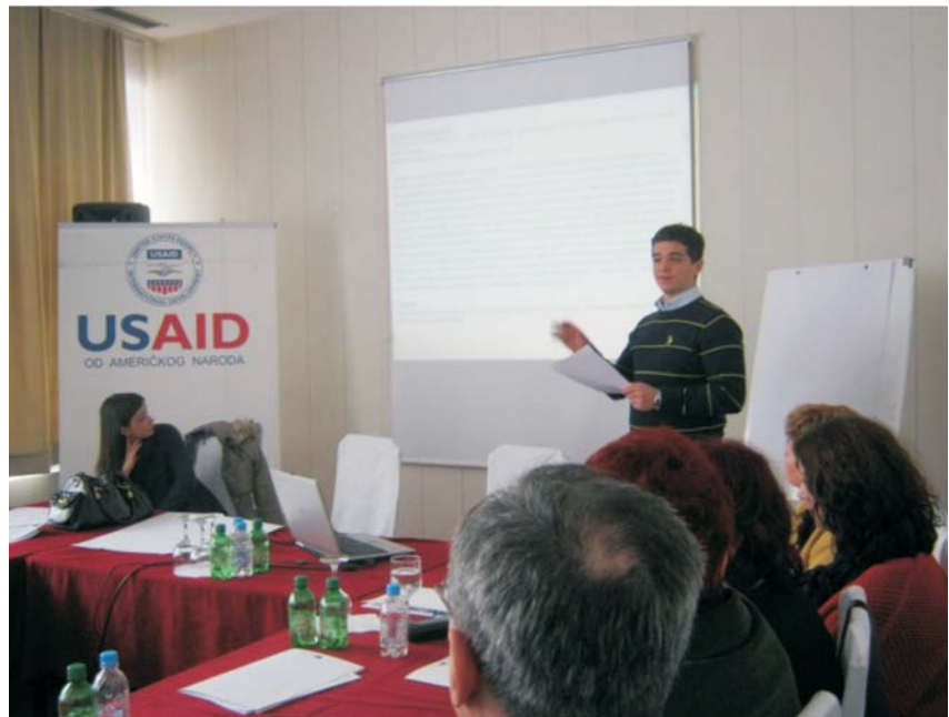
Education training for judges within the project