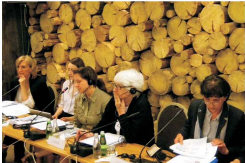
Participation of the attorneys of the Centre at the international conference on asylum.